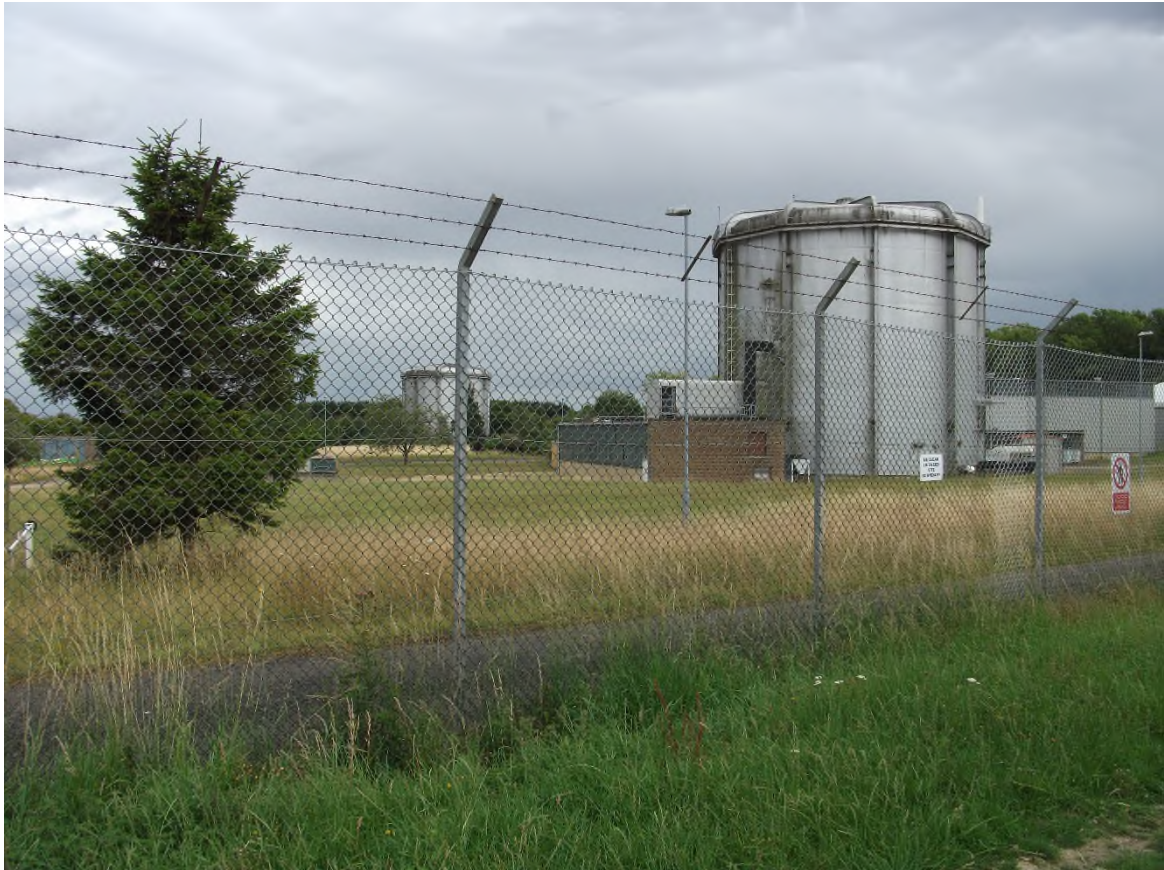
Fig. 6. DIDO and PLUTO – the notices on the fence indicate that it is the boundary of a Nuclear Licensed Site on which trespassing is a criminal offence (author, 2015).

In addition to the HQ building, the 1950s-built former AERE Library has been refurbished for office use, still bearing the name “The Library”. But many working buildings of AERE days – and also all the prefabricated houses – have been demolished, and new working buildings have been constructed.