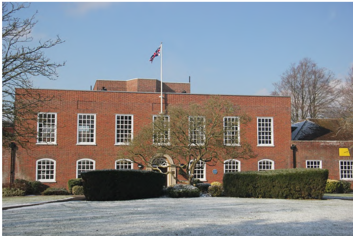
Fig. 1. Harwell Campus HQ (author, February 2018), previously the RAF commander’s office, then the AERE Directorate building, then the AEA Technology HQ, and then temporarily abandoned. In 2017, the RSC plaque (blue) was relocated to the right of the entrance.