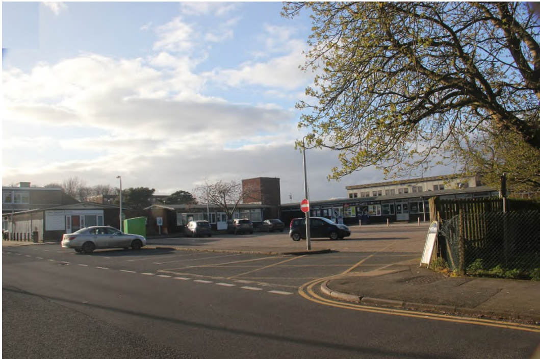
Fig. 3. Shops and a Post Office in Curie Avenue surviving from the AERE time (author, 2017).

AERE was a pleasant and convenient place to work [12]. Cockcroft had rose beds and thousands of trees planted. Outside the security fencing, along Curie Avenue and to the north, brick-built ex-RAF houses and two ex-RAF messes provided accommodation for employees and temporary visitors, and there were shops, a Post Office, a Lloyds Bank, a dentist's surgery, and a nursery (Fig. 3). Sports fields were created (Fig. 4). 200 prefabricated houses ("prefabs") were erected for workers. Works buses ferried many hundreds daily from nearby towns and villages to a large bus park outside the security gate on Fermi Avenue.