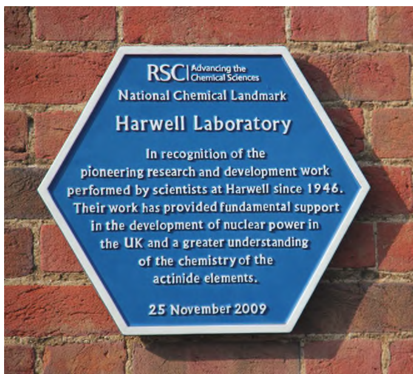
Fig. 5. RSC “National Chemical Landmark” plaque in its new location.

The building of Fig. 1 (“HQ” in Fig. 2) symbolises the renaissance of “Harwell”. After AEA Technology failed, it was closed up with yellow danger signs, looking all the more dismal because of the bare flagpole. But in September 2017, with refurbishment, it became the “Harwell Campus” HQ Building. Moreover, the RSC “National Chemical Landmark” plaque (Fig. 5), previously at “M” in Fig. 2, was moved to the front of the building.