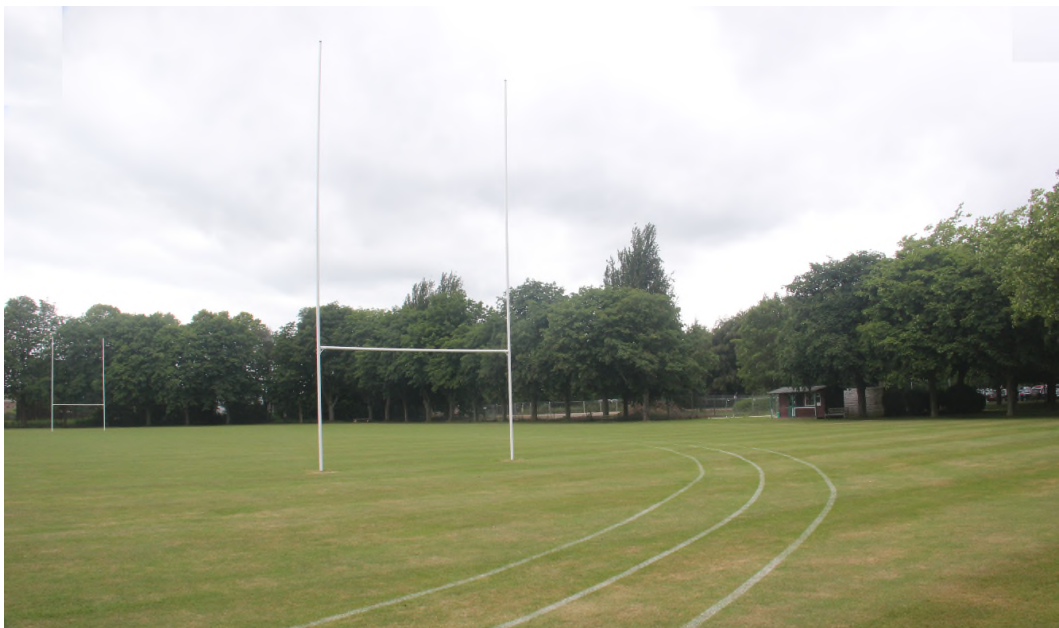
Fig. 4. Sports field (author, 2018).

AERE grew to 6200 employees in 1959 [13].